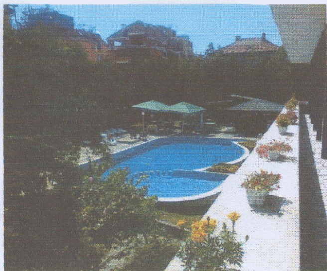
A view to the swimming pool

Usually in June the weather is sunny and quiet. This is why we propose to hold the championships from the 1 st till the 10 th of June 2007. In order to ensure the necessary conditions for the championships we met with Bulgarian Chess Federation and we have their full support and assistance – they will ensure chess playdesks, clocks, the information board and the referees.