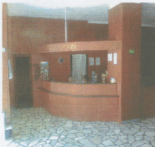
The lobby of the hotel (left)/ and the Reception desk for the registration of the guests (right)